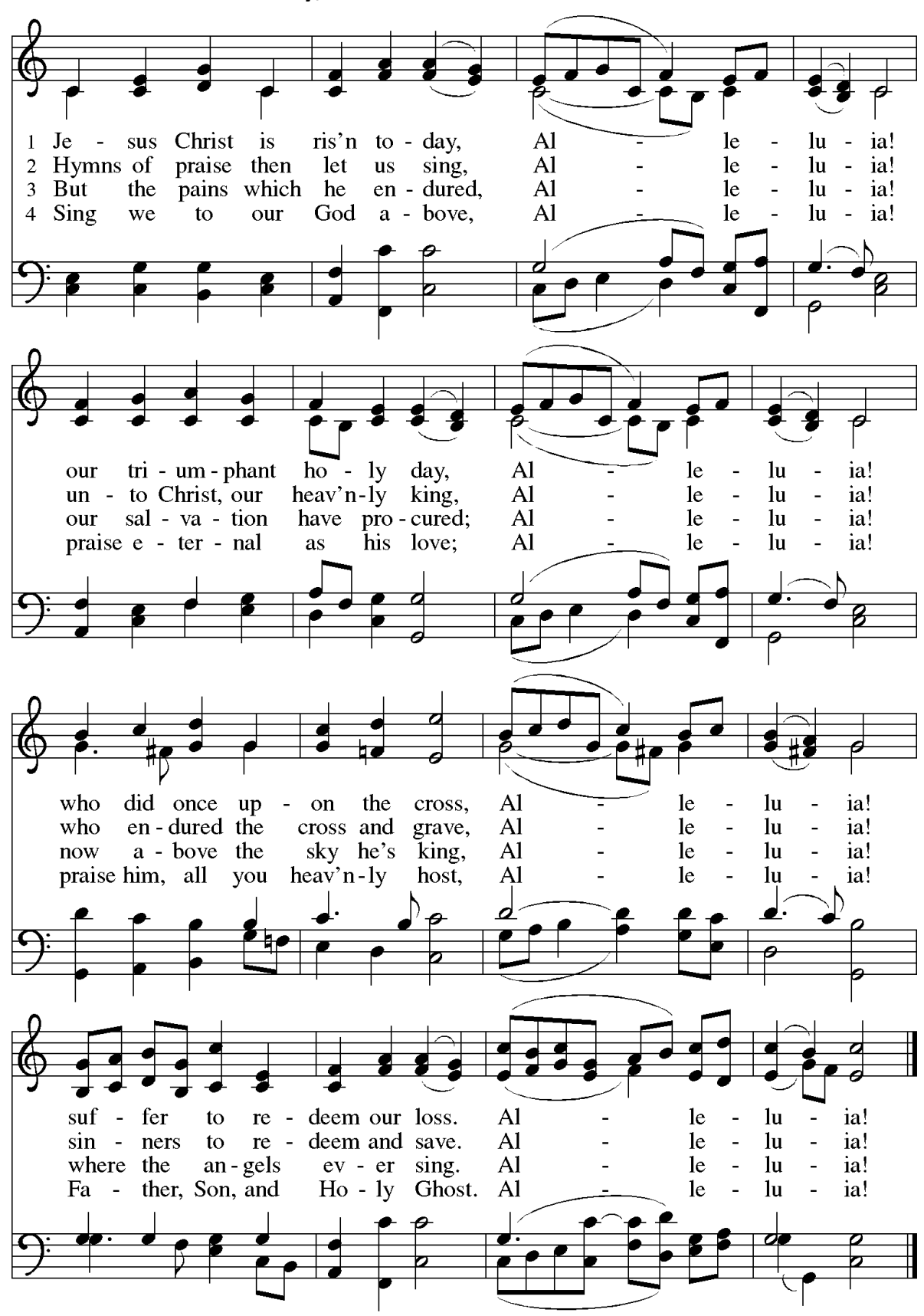
HYMN: Jesus Christ is Risen Today, ELW 365